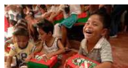
Operation Christmas Child makes kids happy! Those who receive and those who give!

Discovery Club News: The Discovery Club Kids have been busy this past month packing shoeboxes for the Operation Christmas Child project. They packed 24 boxes ( photo above ). Thank you to everyone who donated supplies or money for postage. It was greatly appreciated! They also collected food for the Community Cupboard, our local food pantry, during their annual Turkey Food Scavenger Hunt.